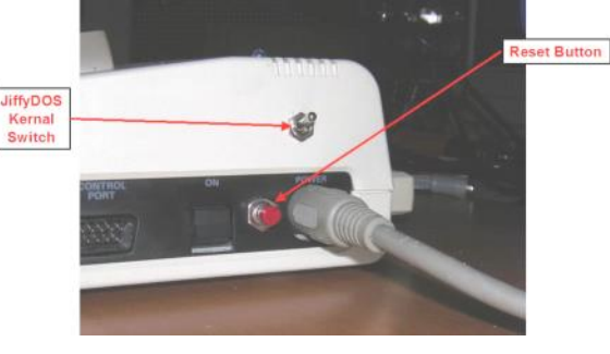
Figure 3 - JiffyDOS switch and reset button