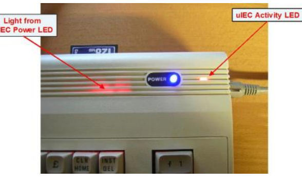
Figure 2 - Blue Power LED and activity LED from uIEC

Nearly every VIC cartridge, game, and utility on one cartridge!