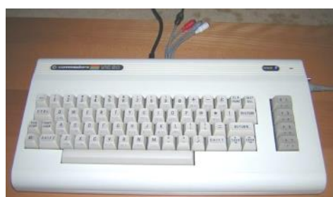
Figure 1 - White keyboard from a Commodore 64C

Plug up to 4 cartridges into the VIC Expansion Port Coming soon? JiffyDOS for VIC (Now available from www.go4retro.com)