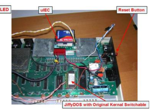
Figure 6 - All the motherboard modifications