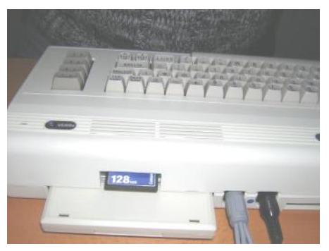
Figure 4 - Cutout above cartridge slot for Compact Flash card